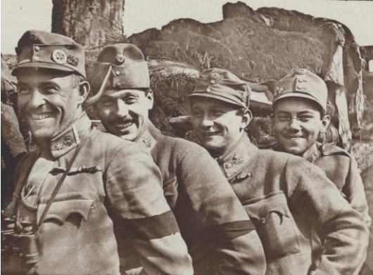
Sammlung Wolfgang Weihs